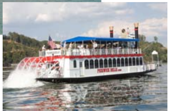
Attractions abound amidst the beautiful Fall colors!