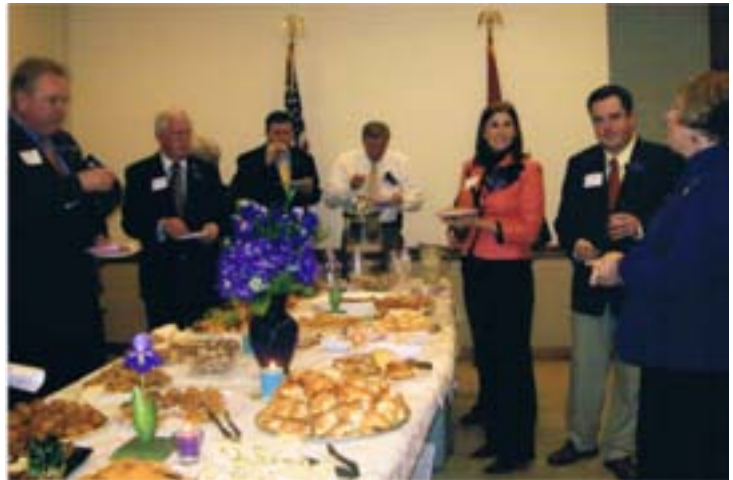
State Legislators enjoying the brunch.